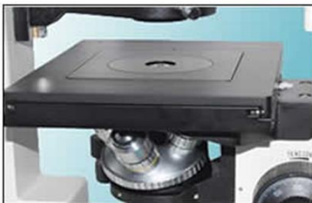
Large Size 200*152mm Double Layer Mechanical Stage, Moving Range 75*30mm, With Shelf For Specimen Dia. 68mm Or 77*33mm Culture Utensil