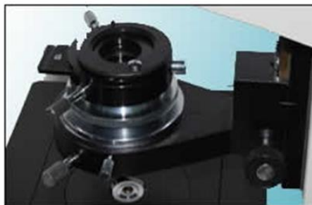
Long Working Distance Condenser, W.D. 30mm, 55mm, Up to 70mm, Rack & Pinion Height Adjustable, N.A. =0.4