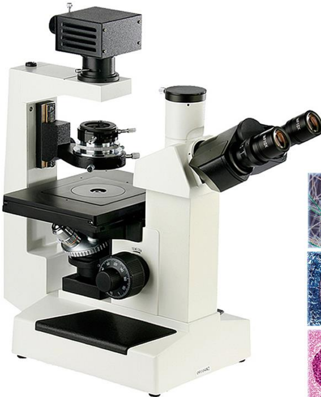
A14.0201 Inverted Phase Contrast Microscope