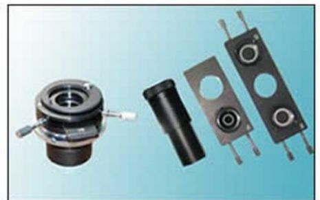
Sliding Type And Impellent Type Phase Contrast Set Available, Including Long Working Distance Phase Contrast Condenser, Objective, Phase Slide, And Centering Telescope